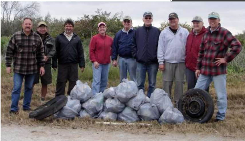
Merritt Island Wildlife Refuse Outing January 31