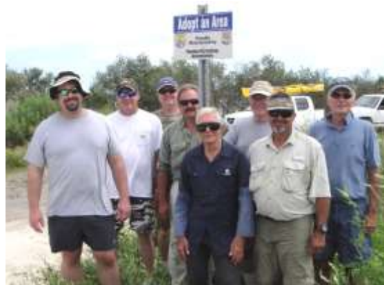
Great bunch of volunteers!