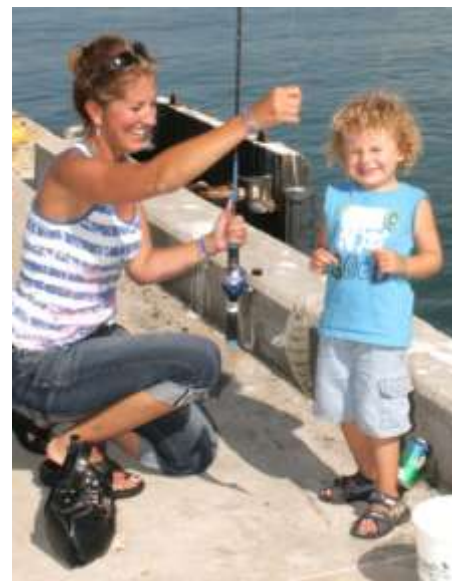
Girls like fishing...but not touching.